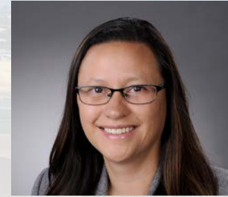
Chief Nursing Officer

Affiliated with Dignity Health for 10 years; four years in current role