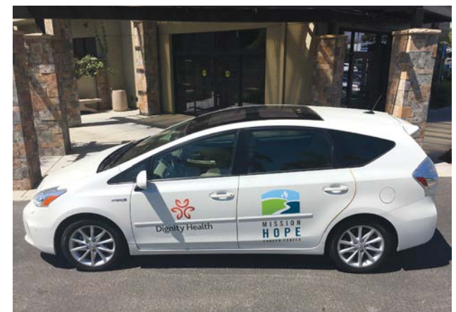
Transport to Treatment Program

Additionally, the Cancer Care Fund exists to provide cancer patients in need with financial assistance, cancer support groups, counseling, and diagnostic screenings. The fund also