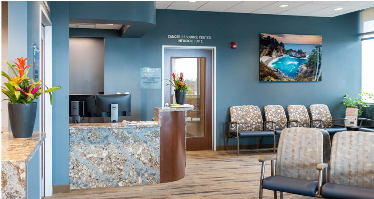
Mission Hope Arroyo Grande

supports an oncology nurse navigator and social worker to guide each patient from diagnosis throughout recovery and connect them with any resources they need.