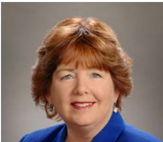
Vice President of Post Acute Care Services

Affiliated with Dignity Health in current role for 20 years