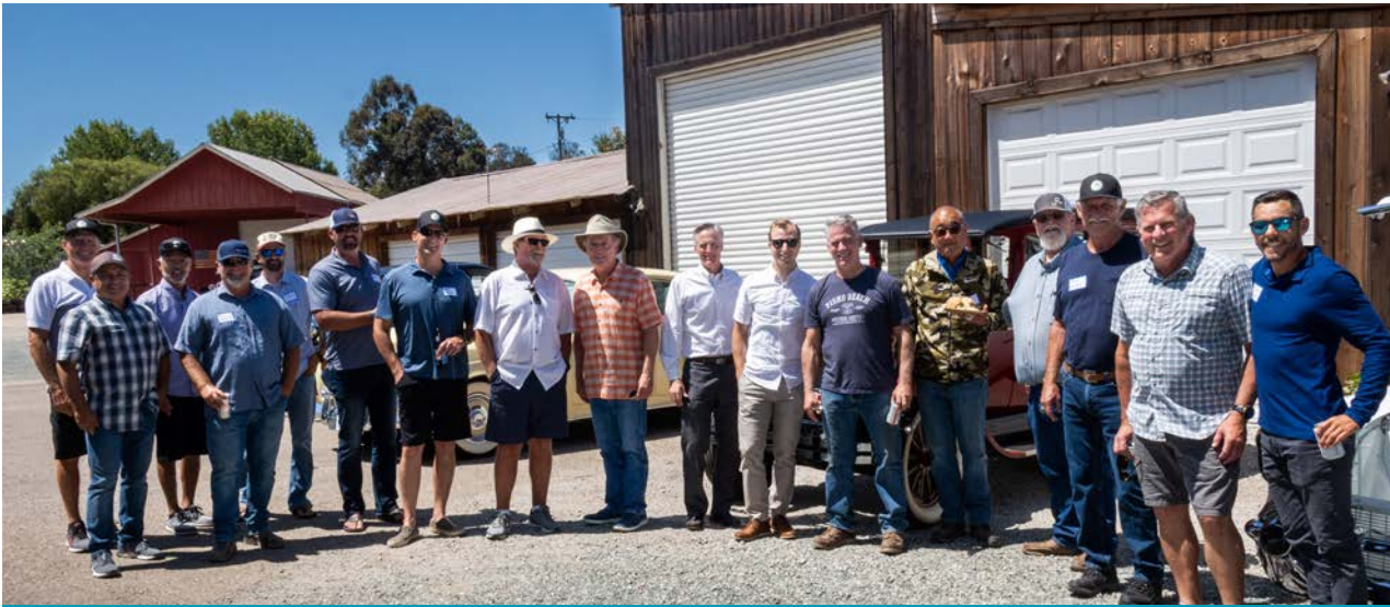
Members of the Carrol Pruett Philanthropic Fraternity enjoy a car show and presentation.