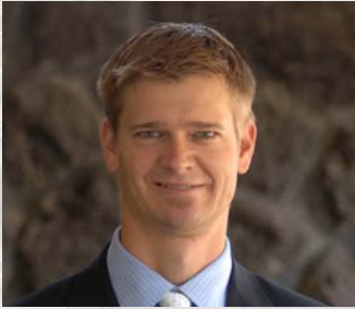
Chief Medical Officer

Affiliated with Dignity Health for 13 years; five years in current role