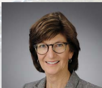
President & Chief Executive Officer

Affiliated with AGCH & Dignity Health for 25 years; one year in current role