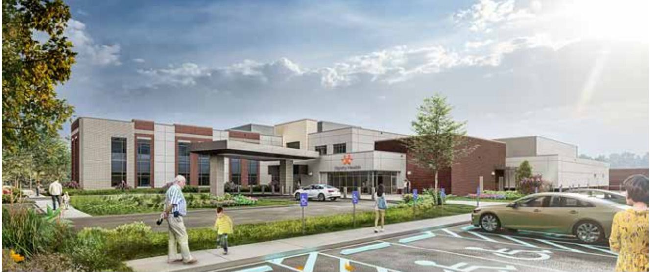
Rendering of the new inpatient rehabilitation hospital at Arroyo Grande Community Hospital.