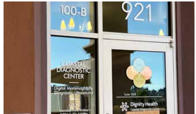
Coastal Diagnostic Imaging Center

The Foundation is amid a $650,000 campaign to bring advanced tomosynthesis (3D) mammography technology to Coastal Diagnostic Imaging Center.