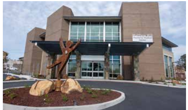
Matthew Will Memorial Medical Center, home of Mission Hope Cancer Center, Arroyo Grande