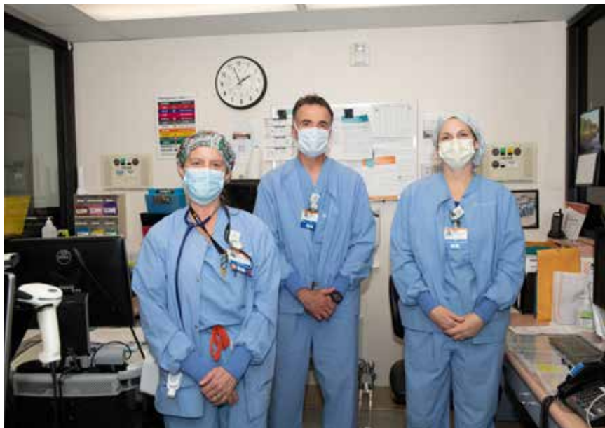
The surgical team at AGCH

If you would like to contribute to a fully modernized surgical program at Arroyo Grande Community Hospital, you can make a gift at SupportArroyoGrande.org or call (805) 994-5421.