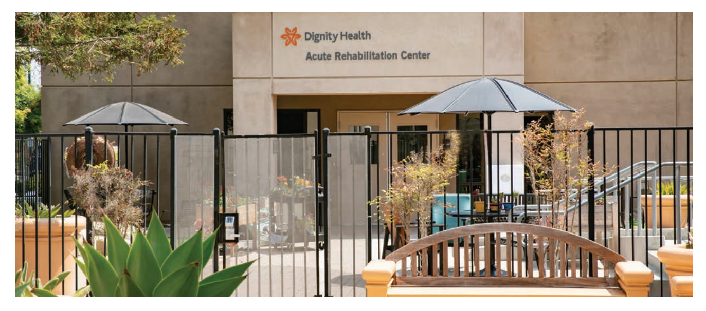
The 20-bed Acute Rehabilitation Center is the only one of its kind within a 100-mile radius. It offers a wide range of inpatient therapy services to help patients on the road to recovery after a life-changing event or illness.

As the only facility of its kind between Salinas and Santa Barbara, the Acute Rehabilitation Center is a valuable asset for Central Coast residents. It provides a hospitalbased, comprehensive and robust program for patients recovering from serious illnesses or injuries such as stroke, brain injury, amputation, and spinal cord injury. Recently, it has expanded its services to treat noninfectious patients recovering from COVID-19 symptoms.