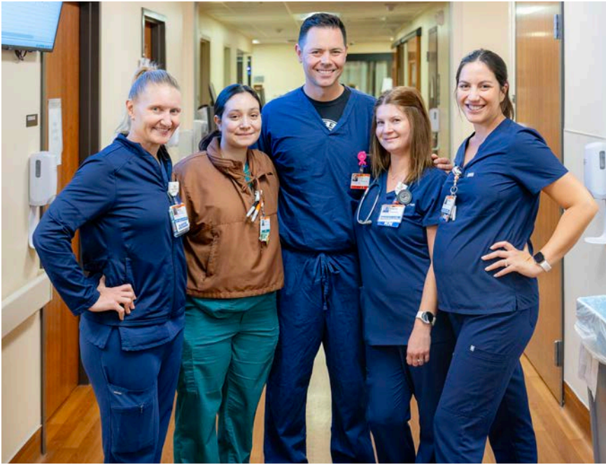
Arroyo Grande Community Hospital nurses share a passion for excellence and community.