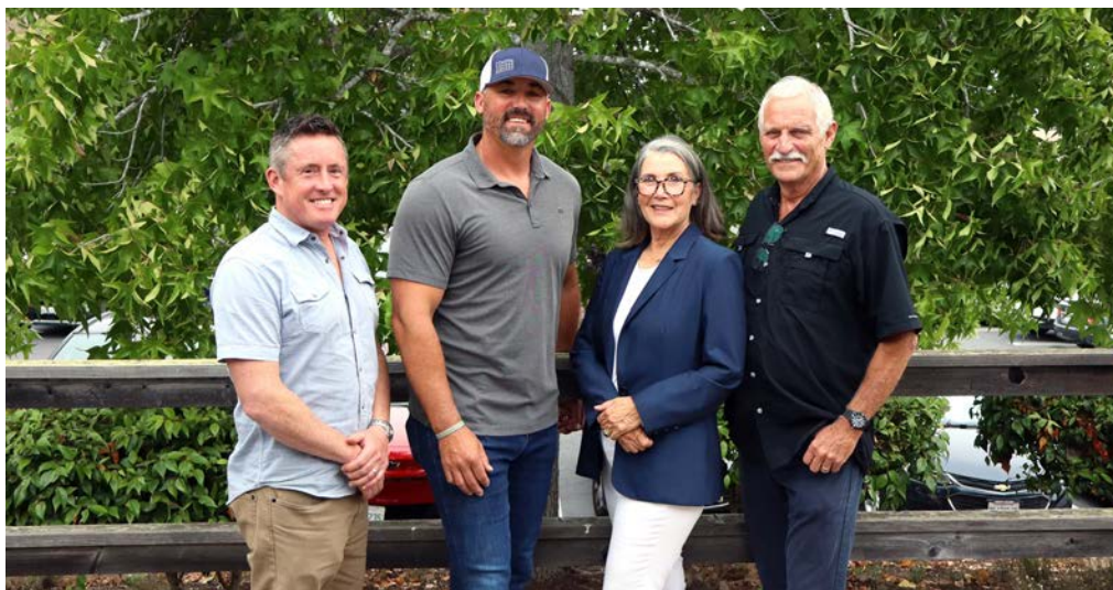
Foundation Board Leadership