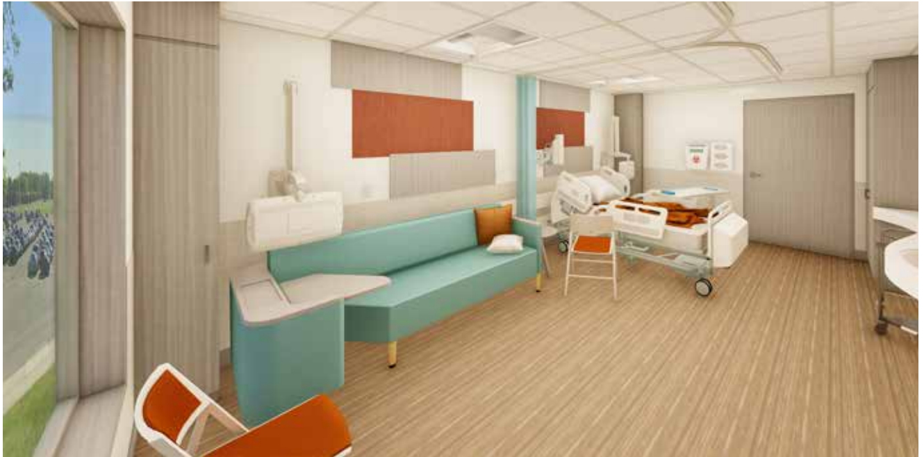
Rendering of a private patient room at Arroyo Grande Community Hospital